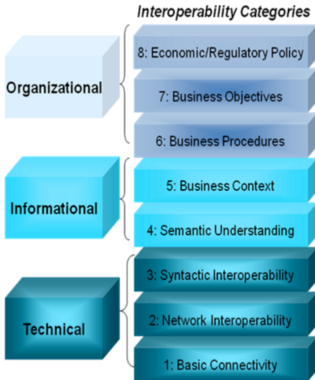
Figure 1 GWAC Stack [9]

The principles laid out by NIST to guide development of the interfaces of the smart grid [1] offer compatible advice. The interfaces should support: